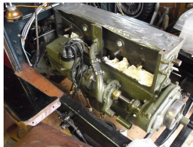
Right side of engine. Starter Generator and water Pump installed.

Our annual picnic was well attended at Tom and Shirl Bush's home on July 15 th . Again fabulous food and fabulous friends are always a winning combination. We are very grateful to have them host this event.