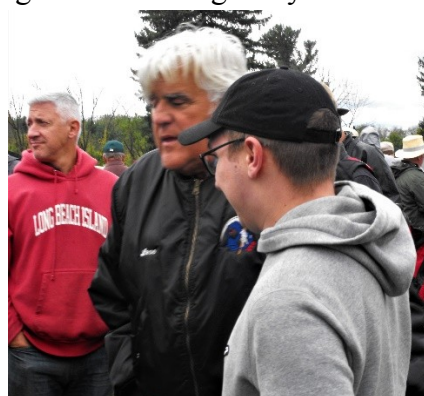
Jay Leno showed up Saturday for the car show.