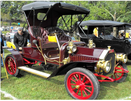
Photo 3 Feature car on program 1908 Model G. This car was also at Hershey.