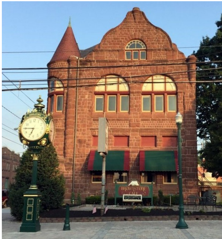
This is the place!!

From, East and South. Route 283 N, make right onto exit for route 441, left on to Toll House Road, continue under 283, turn right onto to Harrisburg Pike (route 441) continue to Middletown when this becomes East Main Street, turn right onto North Union Street continue until the Brownstone and the big Green Clock is seen on the Right at the corner of North Union and West Emaus Street.