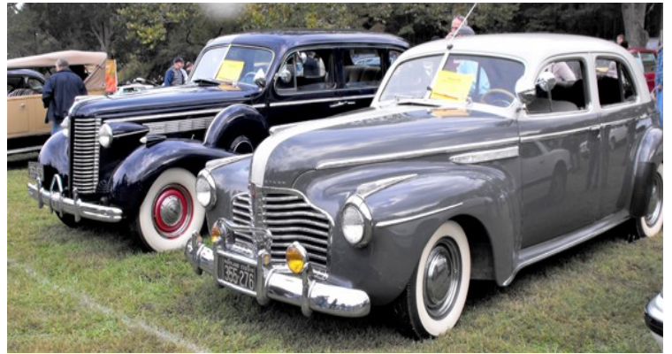
Photo 6 A 1941 Super and the 38 Limited.