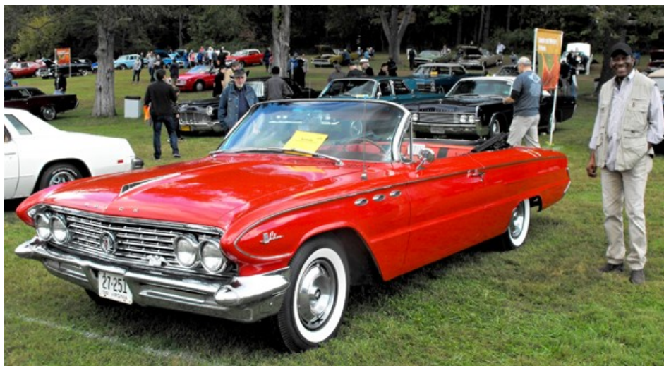
Photo 6 A 1961 LeSabre convertible.

I missed shots of 2 Rivieras, a Reatta, a 1954 Century 4 door and a 1974 Electra coupe.