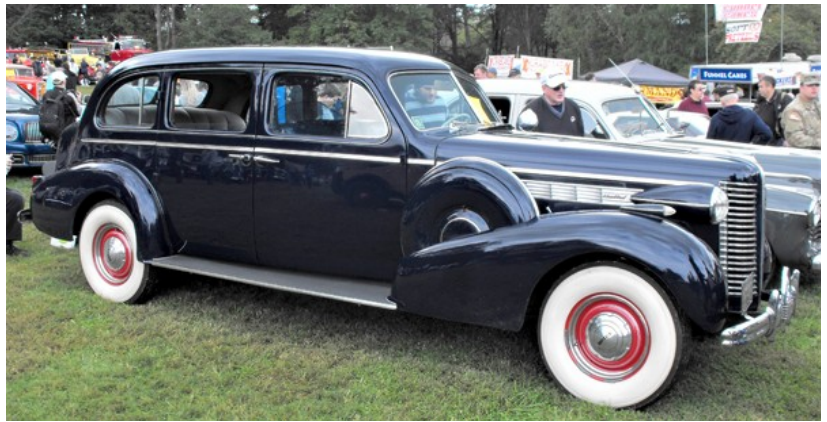
Photo 4 1938 Limited.