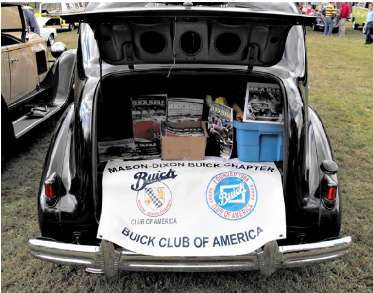
Photo 1 of my trunk.

While I was at the Rockville, MD. Antique and Classic car show I had the trunk of my 37 open for Mason-Dixon Buick Club Business. Bugles Anyone?? 180 mile round trip and a beautiful day. Also a few photos of the 11 Buicks that were there.