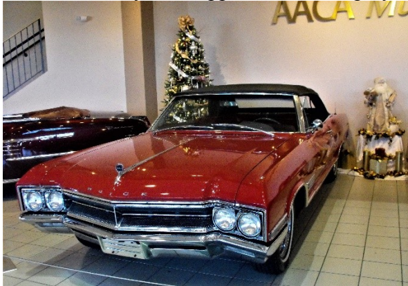
1965 WILDCAT in the front lobby.