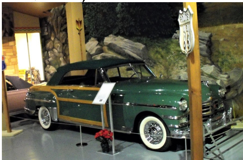
Their 1949 Chrysler Town and Country. Somewhere along Route 66 .

Many other large American “Land Yachts” on display through April 28 th .