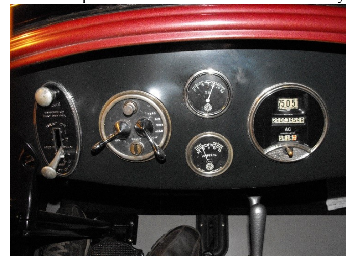
Getting things done on "Remley." New SS water tube. With the rebuilt Speedometer and oil pressure unit "Beulah" now has a full complement of correct gages.

Hershey was a great experience this year with no tornadoes or torrential down pours. Just great seasonal weather. We had plenty of "Buick buddy" visits at our flea market spaces on the chocolate field. The car show on Saturday was a bit iffy with a bit of sprinkles.