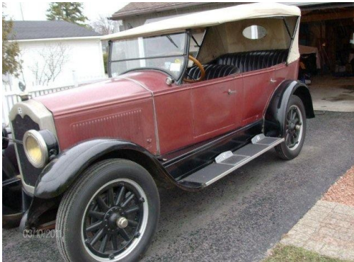
What the car looked like when we bought "Beulah" in 2011

As some of you may know ever since we bought my 1925 "Looking for a driver Buick" in 2011 we have been slowly trying to get things more reliable and reverse some of the interpretive restoration done by prior owners. I mentioned in the last Porthole that the correct top sockets were being fabricated.