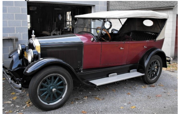
Current appearance with some improvements.