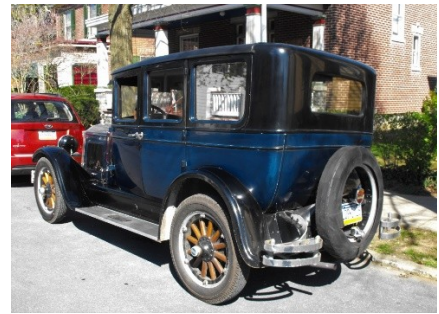
Original upholstery in excellent condition.