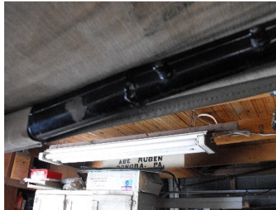
Cut out and re-welded section.